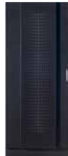
DAY 2 : 1500 kW