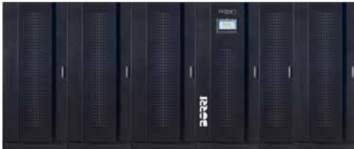
DAY 1 : 1200 kW

INGENIO MAX XT power protection system can be configured with 250 kW or 300 kW MPM power modules. Power expansion or redundancy can be implemented at a later stage by installing additional MPM modules up to 2.1 MW without needing to put the UPS on bypass (*). Thanks to its flexible design and installation you can meet your diverse business needs, either to grow or to revamp your mission-critical applications.