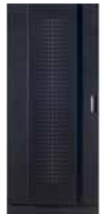
DAY 4 : 2100 kW