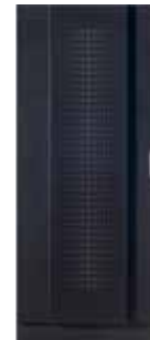
DAY 3 : 1800 kW